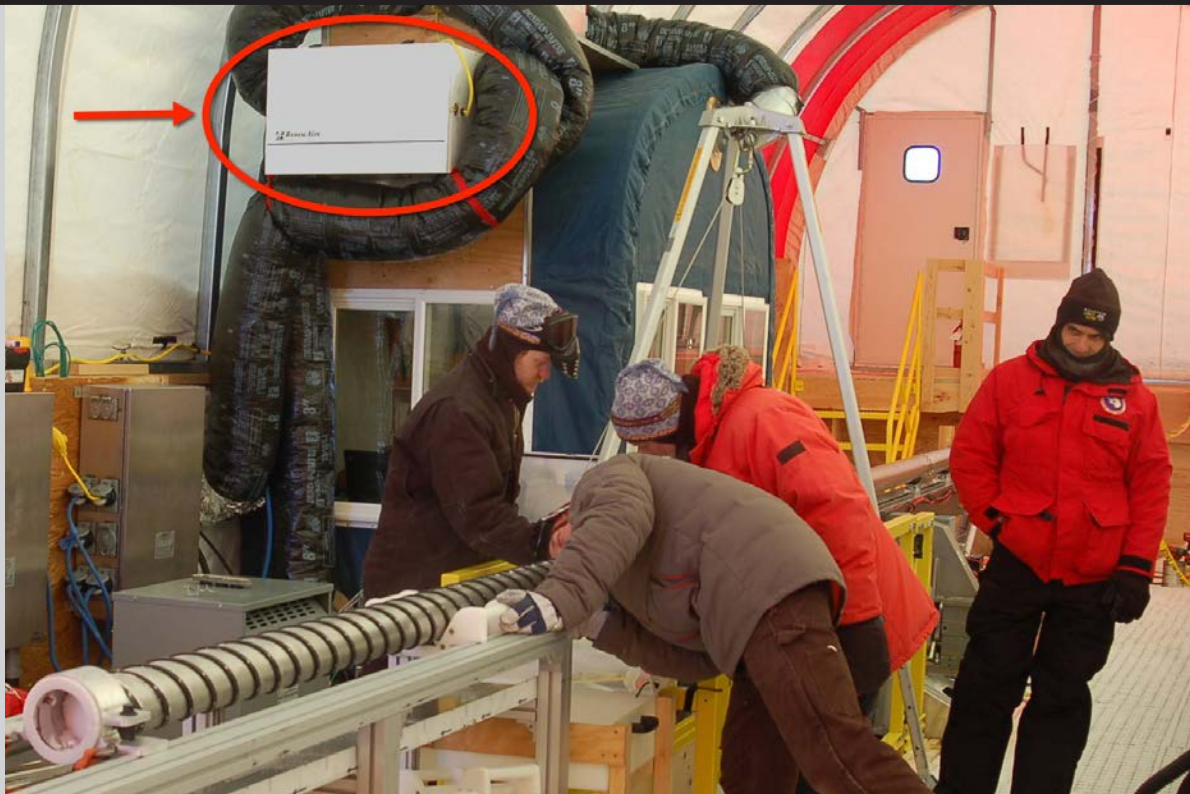
RenewAire ERV (circled in red) at work in temperatures reaching -40°F increasing airflow by 40% in the drill room without consuming extra energy